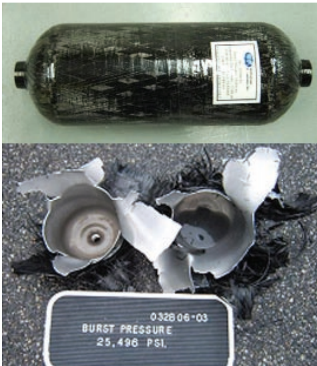
FIGURE 3. Prototype Tank and Example of Burst Test Results