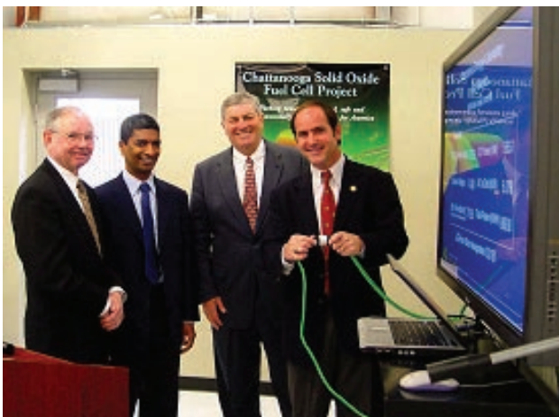
FIGURE 3. System Inaugurated by Congressman Zach Wamp (right) on 17 Feb. 2006

at the Alternative Energy Laboratory on February 17, 2006 (Figure 3).