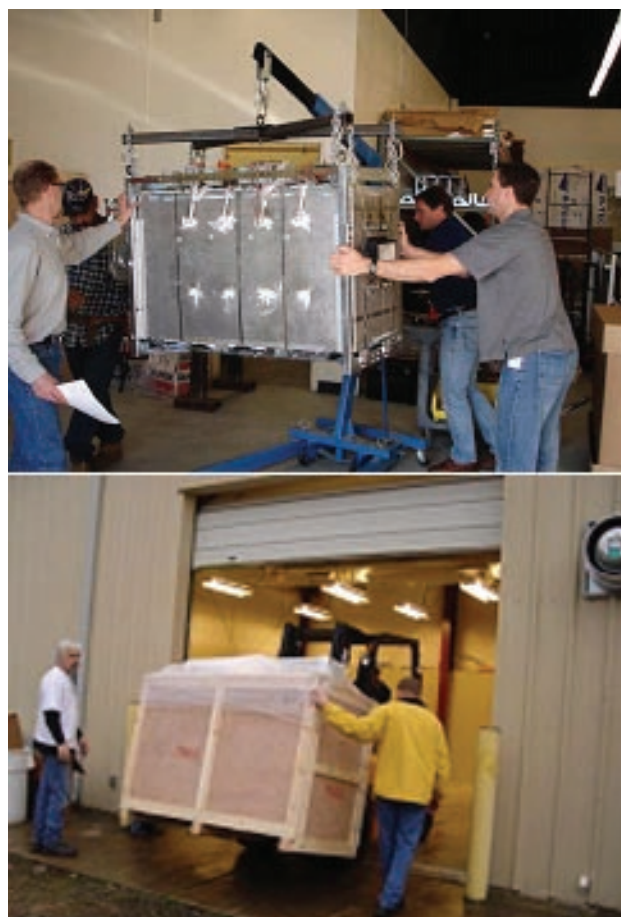
FIGURE 1. Shipping the SOFC System (top); Receiving at UT-Chattanooga (bottom)