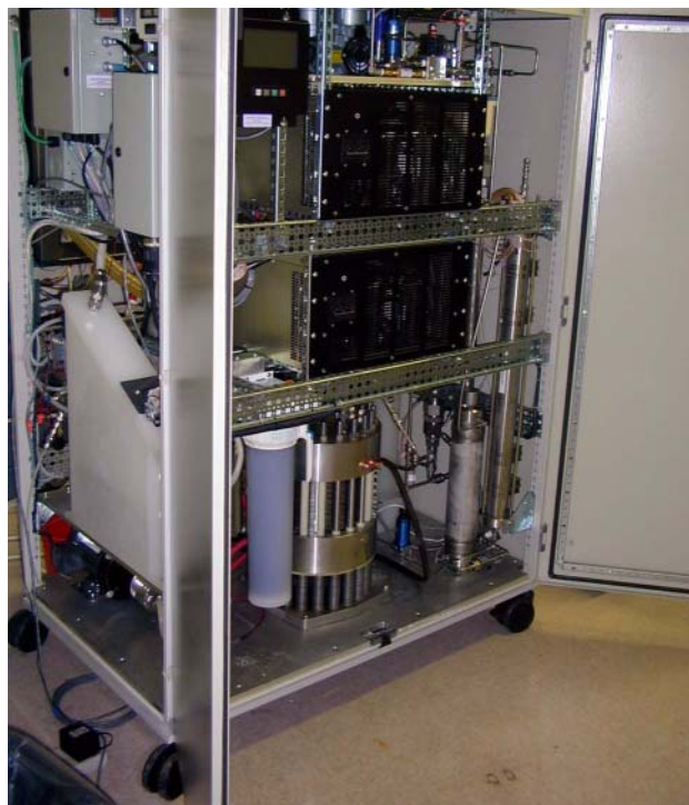
Figure 1. Photograph of 2000-psi Electrolyzer System

Contributing to the reduced stack cost was an 80% decrease in the noble metal catalyst loading. As shown in Figure 2, in single-cell testing a membrane-electrode assembly (MEA) containing a total of 1 mg/cm 2 noble metal had performance