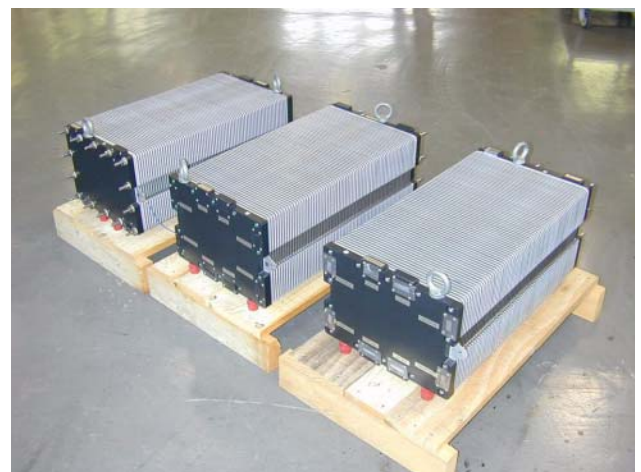
Figure 3. PEM Fuelcell Stacks

hybrid as shown in Figure 2. The module consists of three proton exchange membrane (PEM) fuelcell stacks (Figure 3) rated at 290 V, 300 A, 87 kW gross power along with 112 nickel metal-hydride (NiMH) batteries capable of an additional 65 kW for about 2 minutes. Peak power is thus about 140 kW net for short durations such as loading the bucket with ore and tramping up an incline.