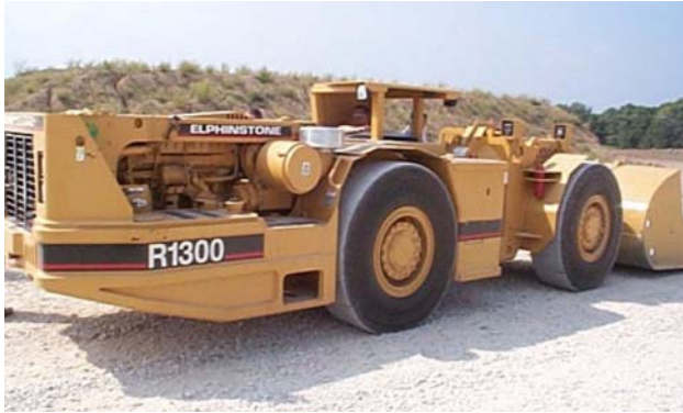
Figure 1. Diesel-Powered Mine Loader

and provide input regarding performance, productivity, and operator ergonomics.