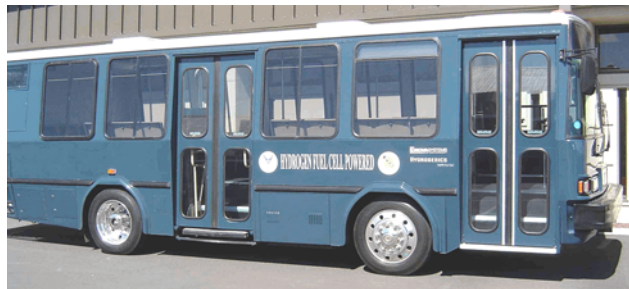
Figure 2. The Fuel Cell Bus at Hickam AFB

transit applications. This information will be fed back to DOE to refocus R&D activities as appropriate.