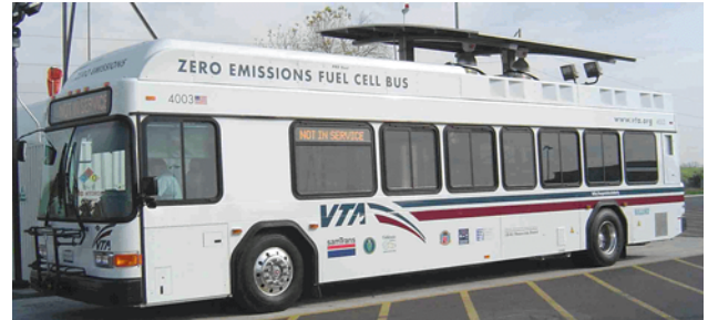
Figure 1. The Buses at VTA Utilize a Fuel Cell System Developed by Ballard Power Systems

Santa Clara VTA: This fleet received all three of its fuel cell buses by the end of 2004. Manufactured by Gillig Corporation, these buses use a fuel cell system developed by Ballard Power Systems. The FCB is shown in Figure 1. Table 1 lists the specifications of the buses, which were operated in test mode for several months on routes without passengers. This allowed the fleet to become familiar with the capabilities of the bus and to work out any issues before carrying passengers. The buses