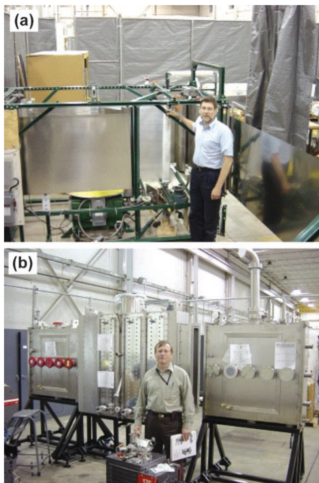
FIGURE 2. (a) A roll-to-roll system demonstrating the transport of a 3ft wide web. This web transport system will allow MWOE/Xunlight to deposition thin film Si solar cells on large substrates; and (b) Large area metal sputtering system.

Another project under this task is the development cheap catalyst materials for substrate-type PECs. The black platinum coated on the rear side of the solar cell is expensive and has poor adherence on stainless steel foil substrate on which triple junction solar cell is formed. Therefore, efforts have been directed in using porous nickel catalysts for the substrate-type PEC cells. The porous electroplated nickel catalyst has been chosen for plating on the back side of the stainless steel substrate of the triple junction amorphous silicon to produce hydrogen. Sintered nickel-cobalt oxide-aluminum catalyst developed at the University of Toledo has been chosen to serve as a counter electrode in the substrate-type PEC cell. Fabrication of 12" × 12" substrate-type solar cells is in progress.