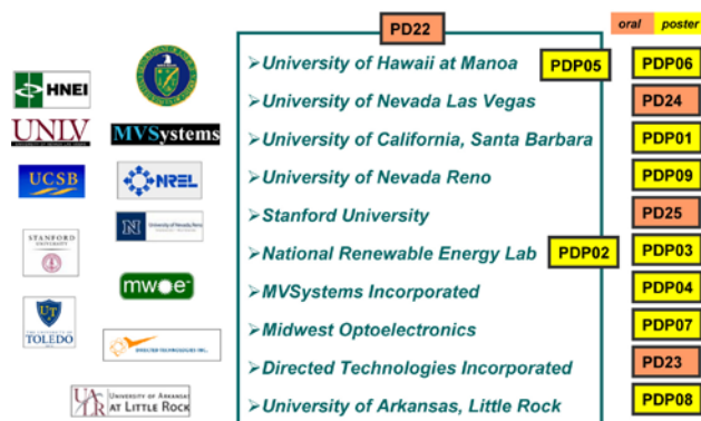
FIGURE 1. PEC Working Group Members with current DOE financial support, including the 2009 DOE Hydrogen Program Annual Merit Review oral/poster presentation designations.

The general approach of the collaborative effort among the DOE PEC Working Group researchers is to integrate state-of-the-art theoretical, synthesis