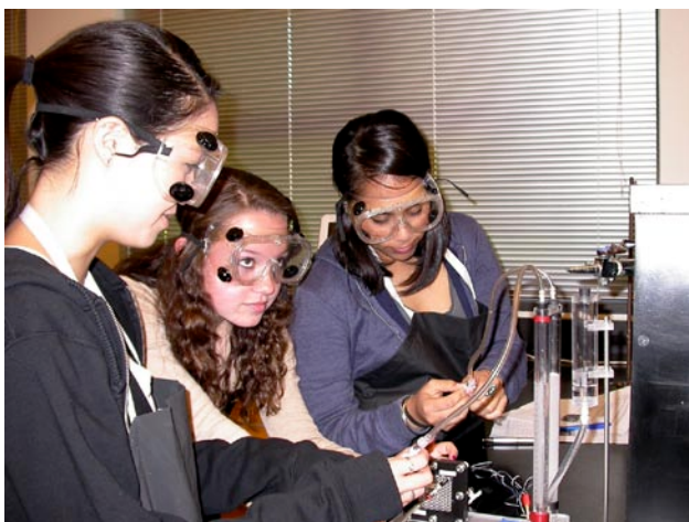
FIGURE 1. High School Students Conduct a HyTEC Curriculum Activity