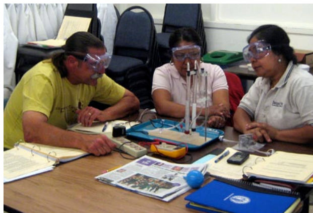
FIGURE 3. Summer 2009 Teacher Professional Development

To the extent possible, teacher leaders working with the project will contribute to future state, regional, and national science teacher conference presentations.