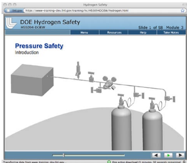
FIGURE 1. A Screen Image from the Pressure Safety Module of the Web-based “Hydrogen Safety Class for Researchers”

Each module is followed by a quiz. After successful completion of all module quizzes (85% passing grade) the student will receive class credit. If a module quiz is failed, the student has the opportunity to review the module and retake that quiz.