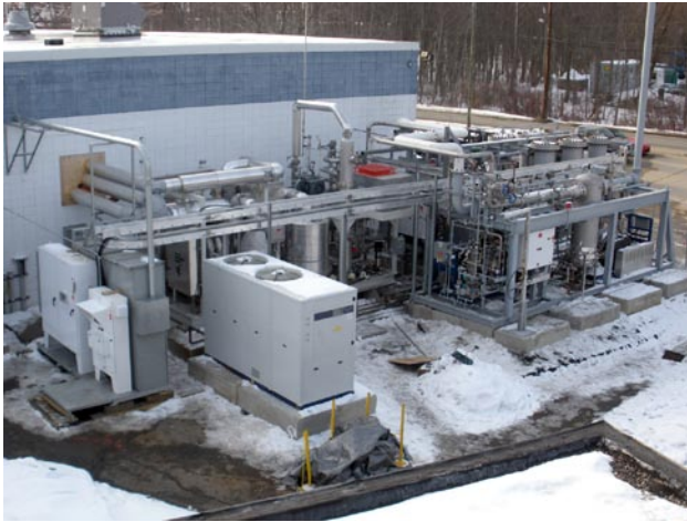
FIGURE 3. Hydrogen Energy Station Anode Exhaust and Hydrogen Purification Systems