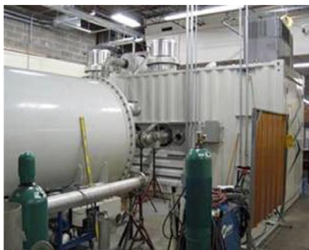
FIGURE 2. Hydrogen-Ready DFC ® -300 Fuel Cell

Figure 4 shows the main results of the shop validation test of the hydrogen energy station. During initial testing in March/April 2009, the system was operated in hydrogen coproduction mode for the first time; in order to better understand the dynamics