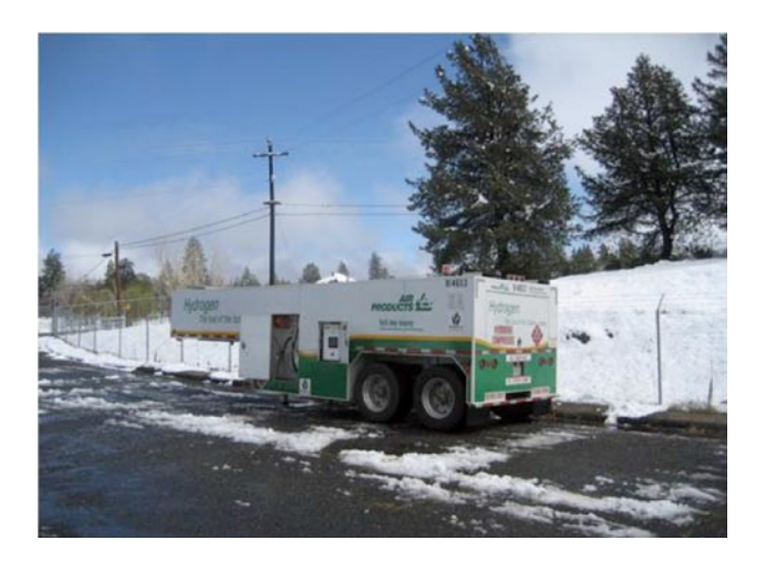
FIGURE 3. Air Products HF-150 Hydrogen Fueler - Placerville, CA

Demonstration Hydrogen Refueling Stations," to install a renewable-based hydrogen fueling station and cleanup system for anaerobic digester gas at Orange County Sanitation District in Fountain Valley, CA. Hydrogen will be produced utilizing the Hydrogen Energy Station concept being developed under a second DOE project (Cooperative Agreement No. DE-FC36-01GO11087). The hydrogen dispenser will be co-located with an existing compressed natural gas fueling island; Figure 4 shows a photograph of the existing dispenser and the proposed location for the hydrogen fueling equipment. A modification to the Cooperative Agreement was executed on 30 September 2009 to include a no-cost