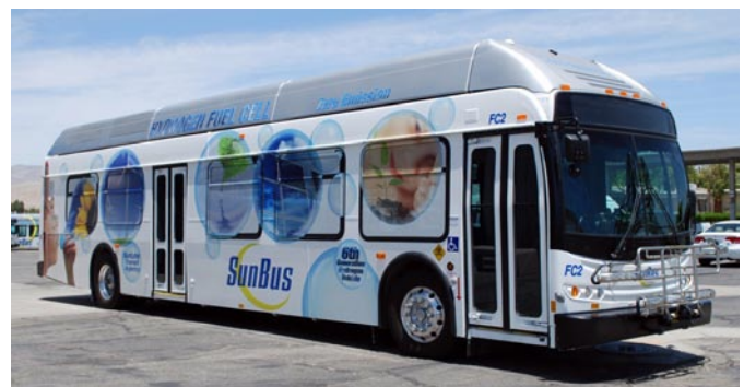
FIGURE 3. SunLine's Newest Fuel Cell Bus