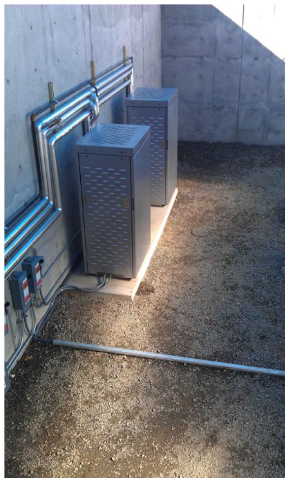
FIGURE 1. Two Micro-CHP FCS Units Tested for this Study in Portland, Oregon

Cost analyses of micro-CHP FCS installations were performed to quantify their current and expected future profitability. Cost data gathered from the manufacturer include the FCS capital cost, additional equipment cost, installation, sales tax, and decommissioning costs, and the total cost of fuel over the lifetime of the project. All costs are recorded in present day dollars. The total project cost along with the DOE cost share for each site is shown in Table 1. The DOE cost share varied from 36 to 44 percent depending on the location. The differences in cost per unit/DOE cost share arise from the differences in additional equipment costs (vary depending on the infrastructure at a given site), variable sales tax, and fuel costs. On average, the cost of one unit is approximately $83,500. Figure 2 shows the average cost distribution among the micro-CHP FCSs in the deployed