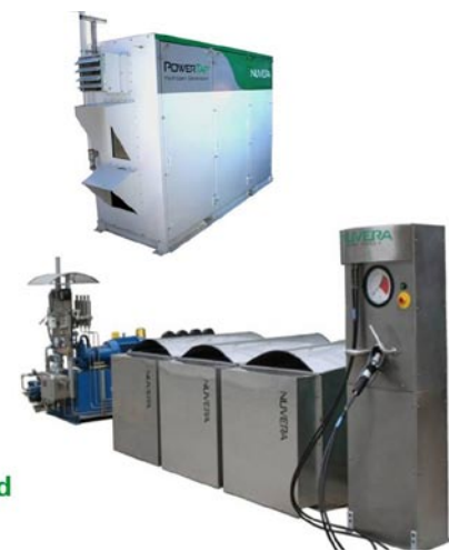
FIGURE 2. Hydrogen Solution