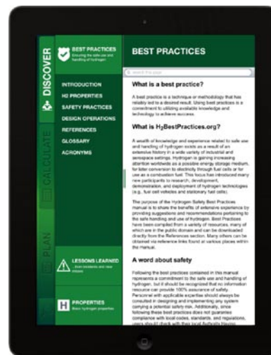
FIGURE 2. Hydrogen Tools iPad App

The safety knowledge tools H2incidents.org and H2bestpractices.org websites continue to see a steady number of visitors. To increase visibility and get this information in the hands of a greater audience, the project has integrated information from the websites into a mobile application (see Figure 2). The “Hydrogen Tools” application brings added value by combining information from the websites (H2incidents.org and H2bestpractices.org) as well as other project resources (safety planning guidance and a safety checklist), calculators and related tools. The mobile app also allows for search capabilities across the incidents and database resources and the best practices can be viewed offline.