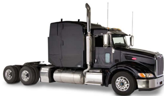
FIGURE 2. Delphi SOFC Demonstration Truck

Delphi's SOFC system, installed on heavy-duty commercial trucks providing auxiliary power, addresses the growing concerns about emissions, fuel consumption,