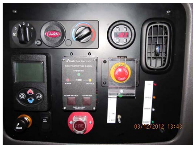
FIGURE 3. "In-Cab" APU Control Interface