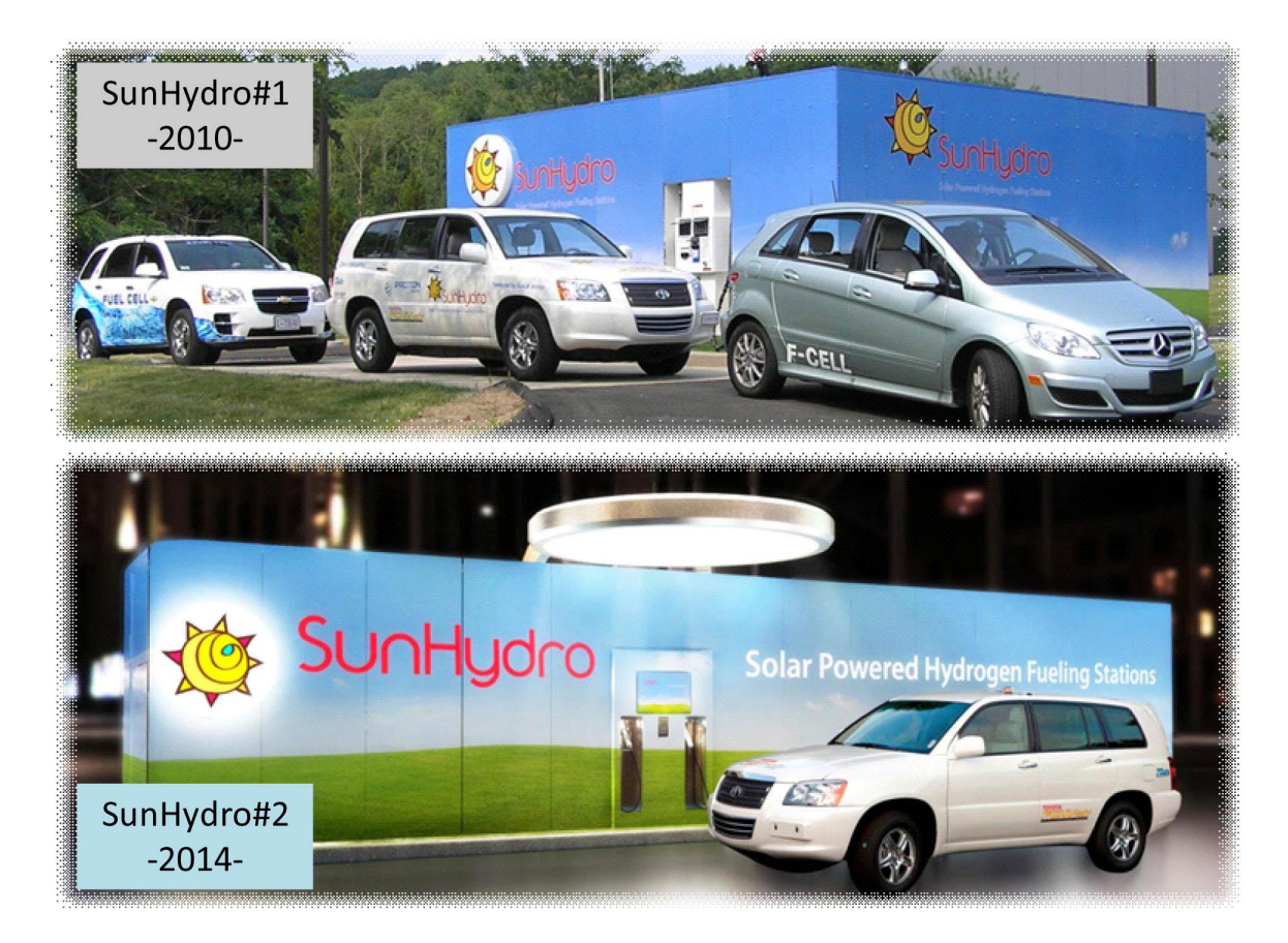
FIGURE 1. SunHydro#1 and SunHydro#2 Stations

These hydrogen fueling improvements will be accomplished based on the following approaches. For higher pressure/higher efficiency PEM cell stacks, Proton has recently qualified a 30% reduction in PEM membrane thickness for 15- and 30-bar hydrogen generator product lines. Furthermore, Proton has been developing advanced catalyst materials and processes that simultaneously reduce the cost of the product and improve the electrochemical performance. A 55-bar militarized cell stack design will be built using the thinner material and advanced catalyst deposition to show the performance improvement at full scale compared to previous technology stacks. We will upgrade a commercial 30-bar C series electrolyzer to operate at 55 bar by strengthening the gas drying components. An increase in hydrogen generation pressure from 30 bar to 55 bar can improve hydrogen fueling system efficiency in two areashydrogen gas drying and dried hydrogen compression into station storage. The dryer purge losses can be expected to decrease substantially since the water vapor concentration at 55 bar will be about 55% of the concentration at 30 bar. Higher dry hydrogen pressure into the station mechanical compressor will result in better combined compression energy and higher throughput capability.