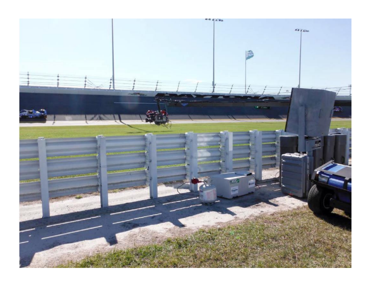
FIGURE 2. Powering a Broadcast Camera at the Rolex24