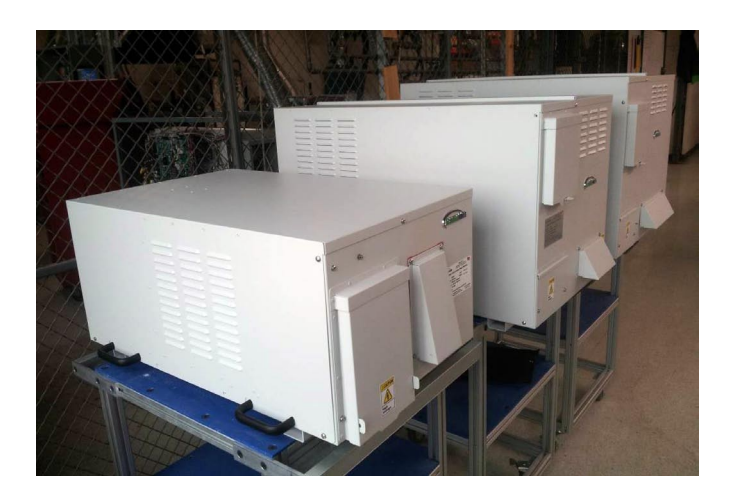
FIGURE 1. Size Reduction of the RP250L

What is also worth noting is the comparison of size and weight of the RP250L to the incumbent unit utilized at races, the Honda 3000. The Honda 3000 has a volume of 17.5" x 21.9" x 25.8" or 5.72 cubic feet while the RP250L comes in