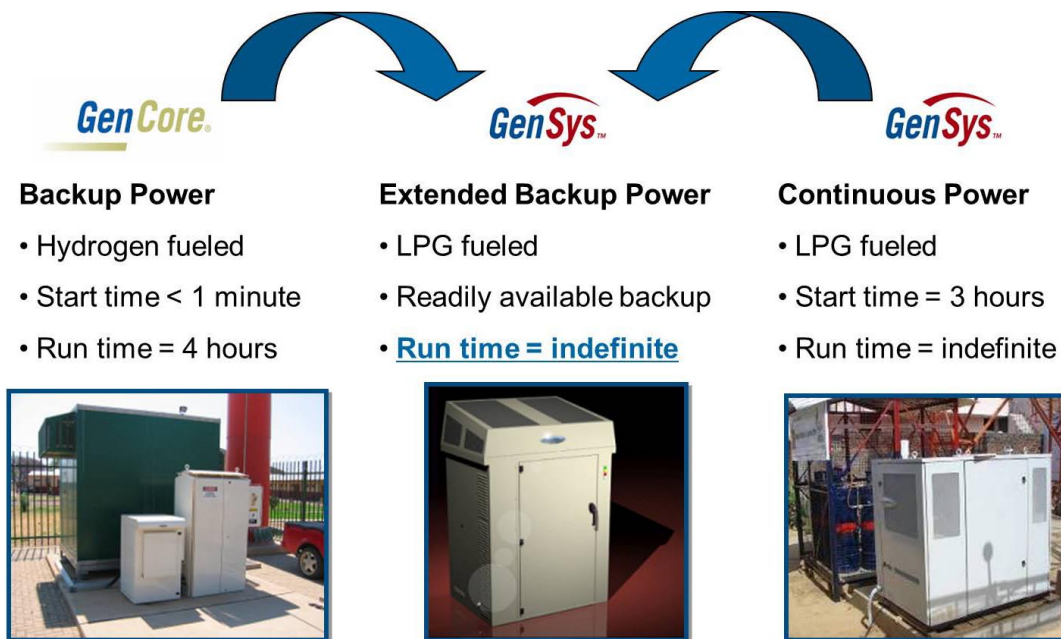
FIGURE 1. Approach

The approach for extended backup is the merging of two Plug Power products—the GenCore and GenSys systems. By combining the field experience of the GenCore in backup applications with the long runtime of the GenSys system, extended backup is achieved, see Figure 1.