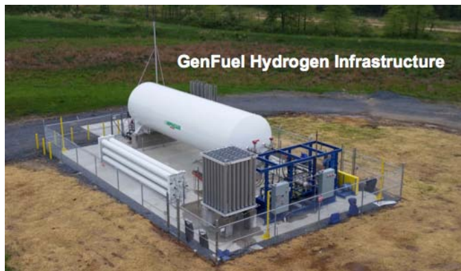
FIGURE 2. Hydrogen solution