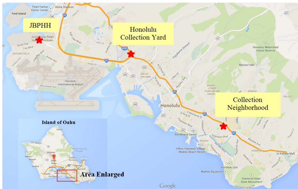
FIGURE 1. JPBHH hydrogen station location relative to Honolulu Collection Yard and neighborhood for refuse collection

The refuse truck starts its day at the Honolulu Collection Yard and commences its refuse route in Waikiki. As shown in Figure 1, Joint Base Pearl Harbor-Hickam (JPBHH) is in