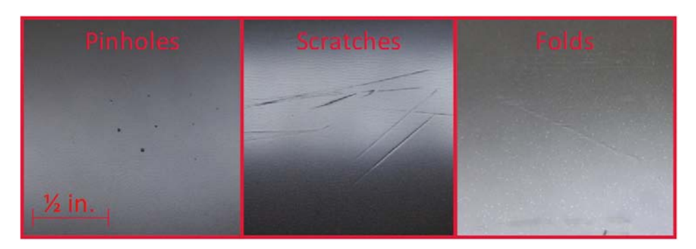
FIGURE 2. Membrane samples illustrating each of the main defect types, including pinholes, scratches, and folds taken edge-lit with a compact camera