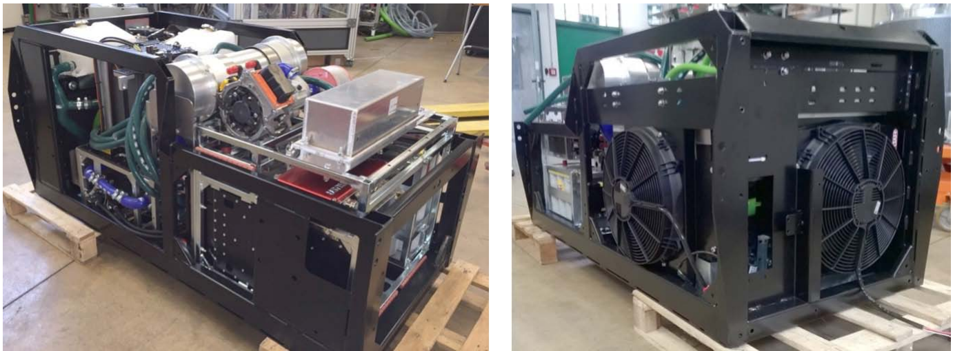
FIGURE 1. Photographs of the Nuvera packaged fuel cell system

Ballard Fuel Cell System Development. During FY 2017, the Ballard team completed their Phase I milestone. This milestone included a preliminary design, safety strategy, and market assessment. The preliminary design included system sizing, system balance of plant selection, packaging, and placement of the fuel cell system on the trailer. To perform the system sizing, Ballard and Walmart selected a demonstration site and used power usage and location data to size the fuel cell system and hydrogen tankage. Winter Haven, Florida, was the selected demonstration site to be a bounding case for Walmart distribution centers because of its high summer temperatures and humidity. Analysis of the data collected from 16 TRUs indicated that the Carrier electric hybrid TRUs required a peak power of 18 kW (see Figure 2). The highest hydrogen usage was 19 kg over the