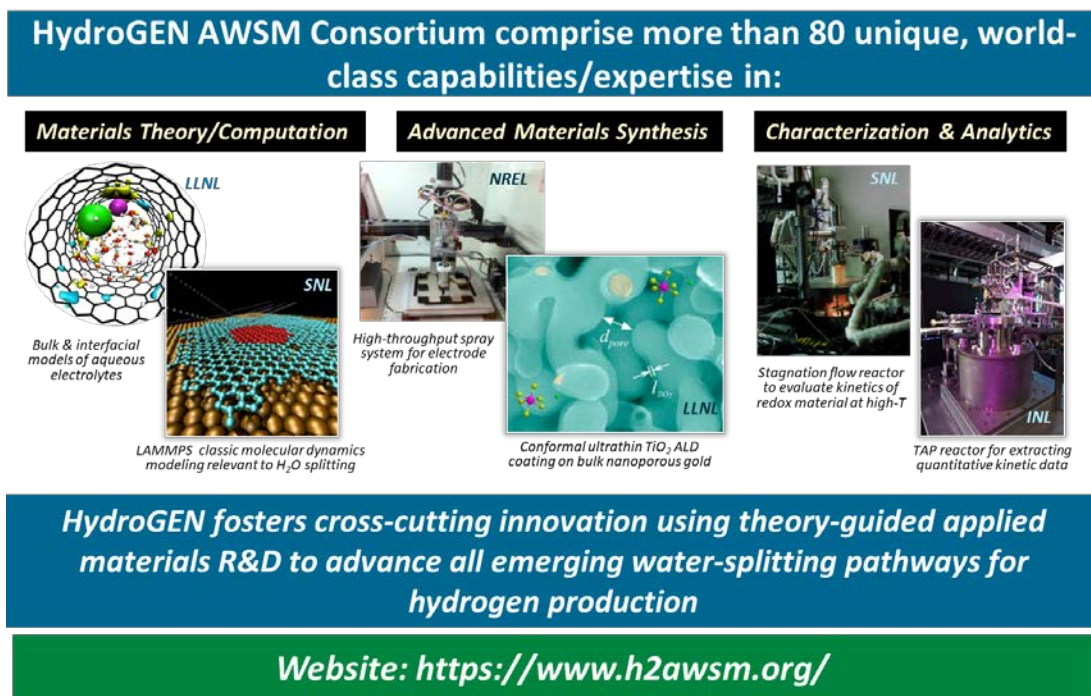
Figure 2. The HydroGEN AWSM consortium fosters cross-cutting innovation using the world-class, unique capabilities and expertise in materials theory and computation, advanced materials synthesis, and characterization at the national labs

HydroGEN has a world-class materials capability network, comprising >80 unique, capabilities/expertise in materials theory/computation, advanced materials synthesis, characterization, analysis, and integration (Figure 2). Each capability represents a resource node—a combination of a tool, technique, and expertise—that is unique to the national laboratory system, available to external stakeholders, and relevant to one of the HydroGEN water-splitting pathways. HydroGEN capability nodes are assigned a readiness category (1, 2, or 3) to inform potential users of their development status. For example, a category 1 node is fully developed and has been used for AWSM research. A category 3 node requires significant development for use by an AWSM project partner.