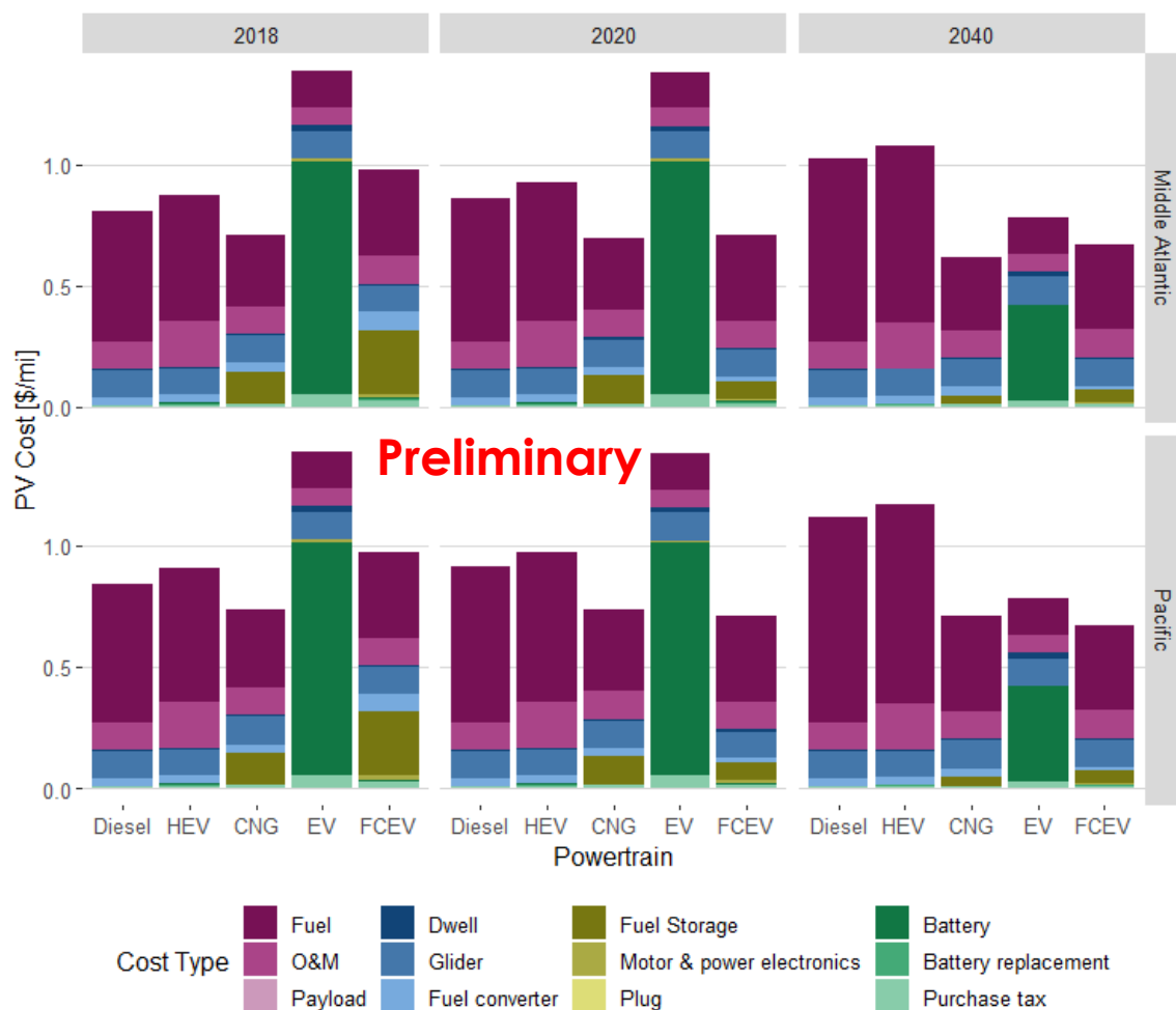
Figure 1. Present value cost ($/mile) for Class 8 long haul tractors traveling 100,000 mile/yr in the (top) Middle Atlantic and (bottom) Pacific region under the Low Electricity and Hydrogen Prices scenario

In the low electricity and hydrogen prices scenario, Class 8 short haul (range requirement of 500 miles) truck TCO follows a similar story as Class 8 long haul. By 2020, fuel cell electric powertrains are estimated to have the lowest TCO in certain high-fuel-cost regions such as the Pacific region. Figure 2 summarizes the Class 8 tractor TCO on a per-mile and per-ton-mile basis (where ton refers to the maximum tonnage of payload the truck can haul while remaining within the 80,000 lb gross vehicle weight rating) for the Pacific region as a function of vehicle range required.