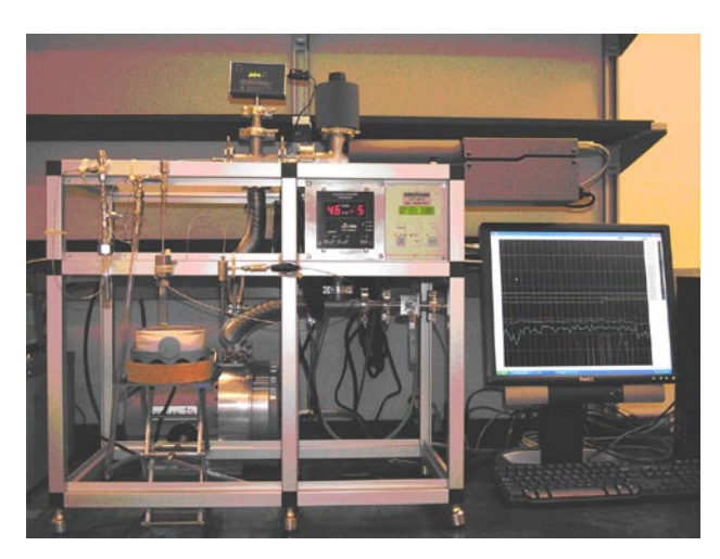
FIGURE 3. In-House Built for Measuring Kinetics and Purity of \rm H_2 Evolution in Real Time

One major drawback of the hydrolysis and alcoholysis of organosilanes is the production of silanols and silylethers, respectively. Both products contain thermodynamically robust Si-O bonds, which require reactive (and expensive) hydrides to recycle back to the organosilane fuel. Therefore, we have begun studying organometallic catalysts for dehydrocoupling of hydrogen-rich organosilanes, analogs of hydrocarbons, Figure 4. Thus far the best catalysts in hand dehydrogenate only 1-2 of the available hydrogen equivalents on the silane giving low molecular weight polysilanes. We plan on investigating the kinetics and mechanisms of these reactions to understand which properties on the catalyst are desirable. We will also be investigating the regeneration of Si-H bonds via catalytic