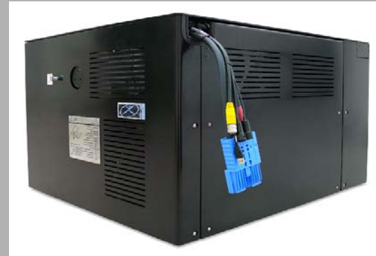
Hydrogenics Model HyPx1-33, Fuel Cell Power Pack