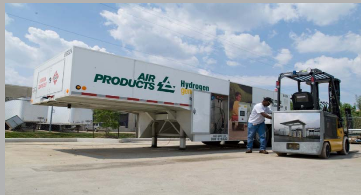
Air Products Model HF-150 Mobile Fueler