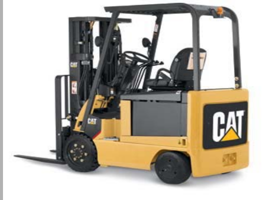
CAT Model E5000 Class I - 48v lift truck