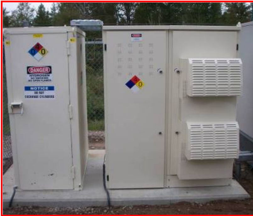
HYDROGEN STORAGE MODULE (HSM)