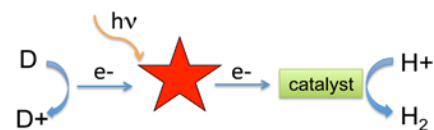
Figure 1. Schematic showing light-driven hydrogen generation using a photosensitizer (red star), sacrificial electron donor, and catalyst.

To improve the performance of these systems we are engineering QD heterostructures with enhanced internal charge separation. CdTe/CdSe/CdTe nanobarells are promising candidates because the staggered band alignment forces spatial separation of the photoexcited electron and hole, while still allowing for facile charge transfer. Pairing a Ni-DHLA catalyst with the nanobarell photosensitizer and ascorbic acid as the sacrificial electron donor yields H 2 from water with a TON increased ten-fold relative to QDs of similar diameter.