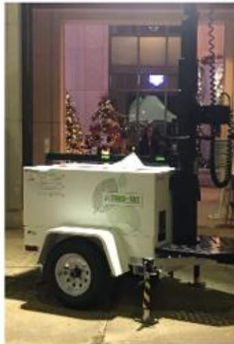
Luxfer GTM ZeroSet Lite at Kapolei Hale