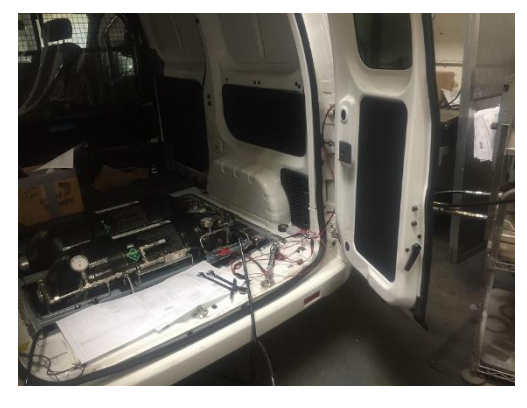
H<sub>2</sub> Tank Integration