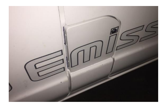
H2 Fueling, Passenger side (fueling location)