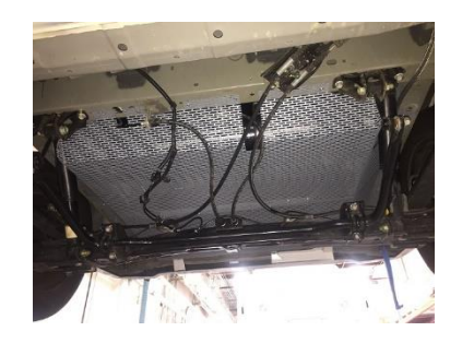
Under Body front view