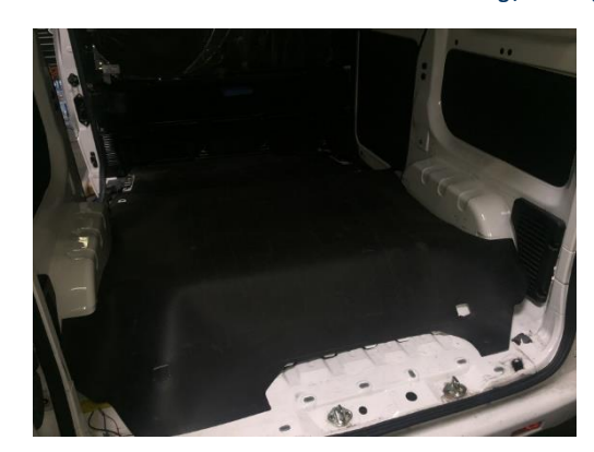
Cargo Space Rear View (5" Floor raised)