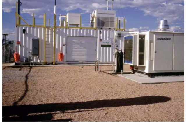
Las Vegas Power Park Producing Hydrogen for Vehicles and Electricity

National labs and fuel cell developers reduced the high-volume cost of automotive fuel cells from $275/kW (2002) to $175/kW (2004) using innovative processes for depositing platinum catalyst. Additional research is needed for fuel cells to achieve the cost target of less than $45/kW to be competitive with gasoline-hybrid engine technologies.