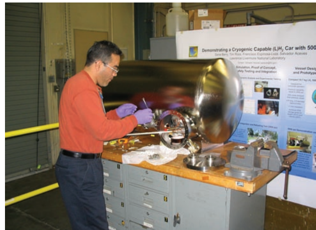
FIGURE 2. New Design for Insulated Pressure Vessel