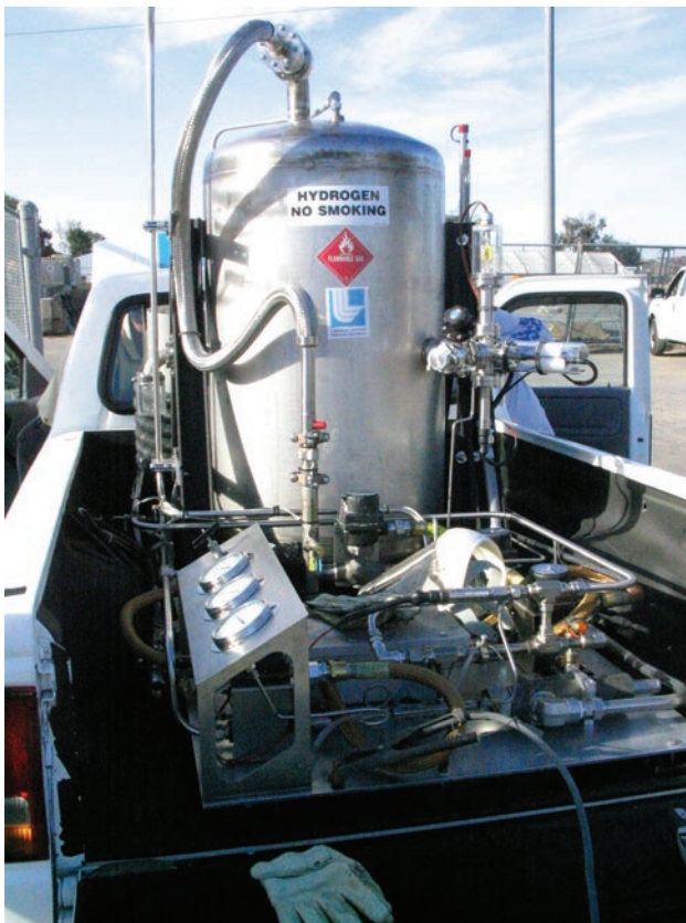
FIGURE 1. Insulated Pressure Vessel Installed in a Hydrogen Fueled Pickup Truck

This year we built a new insulated pressure vessel design (151 liter internal volume, Figure 2) that stores more fuel (10.7 kg LH 2 ) than the previous generation, in a total package that is considerably more compact. The dimensions of the inner vessel and the outer vacuum shell are shown in Figure 3. This design is projected to meet the DOE 2007 volume target (1.2 kWh/liter, tank only) and the 2010 DOE weight target (2 kWh/kg). The vessel has a maximum pressure rating of 34.5 MPa (5,000 psi), and will be installed in the trunk of a hydrogen-powered Toyota Prius hybrid vehicle converted by Quantum, Inc. of Irvine, CA.