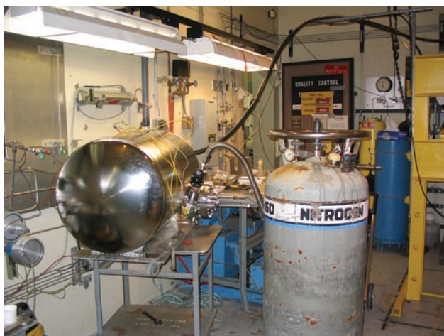
FIGURE 4. Cryogenic Testing of Insulated Pressure Vessel at LLNL High Pressure Laboratory

We are thoroughly testing this new insulated pressure vessel design (Figure 4) to guarantee good thermal and structural performance with no leaks or loss of vacuum. The Toyota Prius vehicle was delivered to LLNL in June 2006 and we are currently installing the vessel in the vehicle.