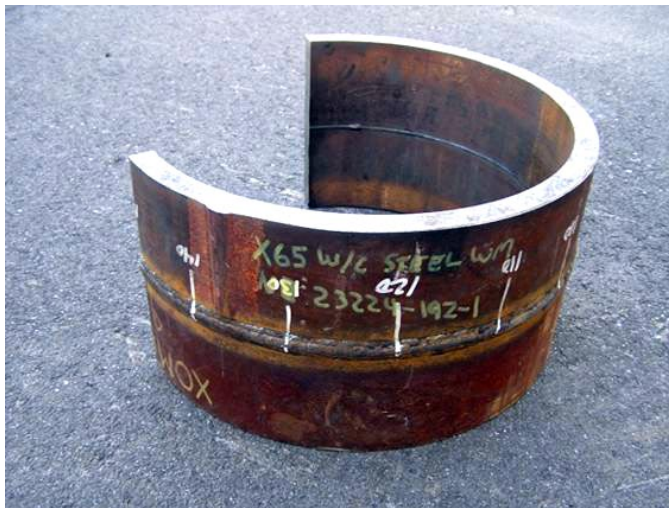
FIGURE 3. X65 steel girth weld supplied by industry partner